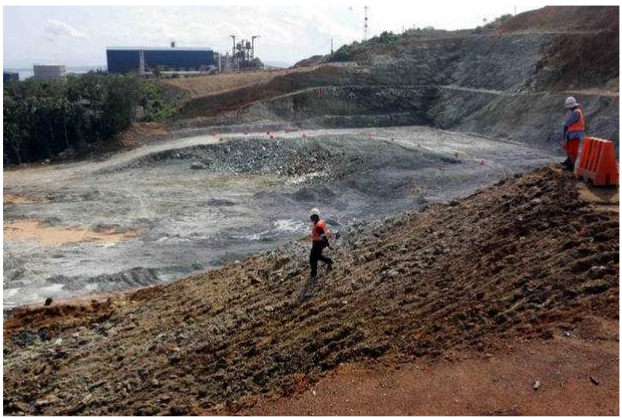
Filipino field technicians work in Lafayette Mining's open pit multi-mineral mine at Rapu Rapu island in the central Philippines, 350 km (217 miles) south of Manila.