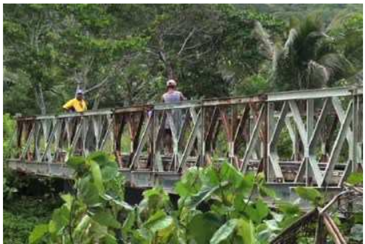
Misima mine failed to deliver benefits for local people

State Team to Assess Breakdown of Vital Services in Misima EMTVvia PNG Mine Watch 21 February 2014