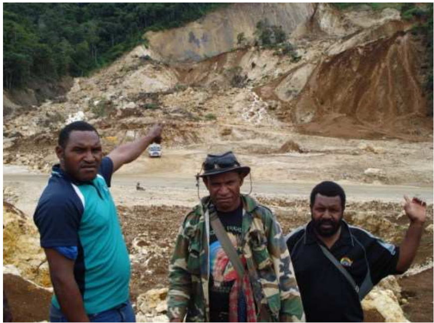
Villagers in Papua New Guinea point to their village destroyed in a landslide from a quarry being excavated for a liquefied natural gas project. Credit: Catherine Wilson/IPS

Catherine Wilson, IPS, via PNG Mine Watch 23 February 2014