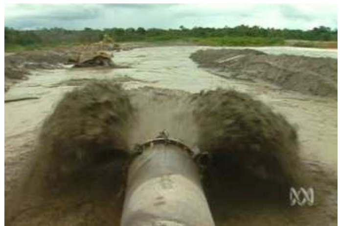
PHOTO: A pipe from the Ok Tedi mine pours waste into the Ok Tedi river

TONY EASTLEY: Papua New Guinea's National Court has ordered the Ok Tedi mining company to stop dumping waste into a local river - a move that would effectively shut down the mine. The court has also ordered that company bank accounts be frozen after allegations were made that money earmarked for local development had been mis-used.