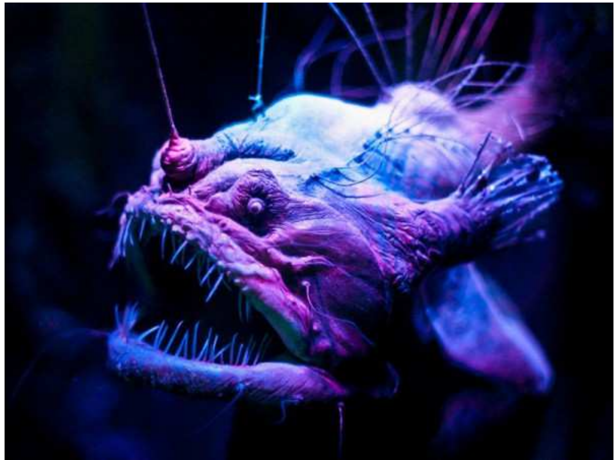
This weird deep sea angler fish lives at abyssal depths that exert pressures of 11,000 pounds per square inch.