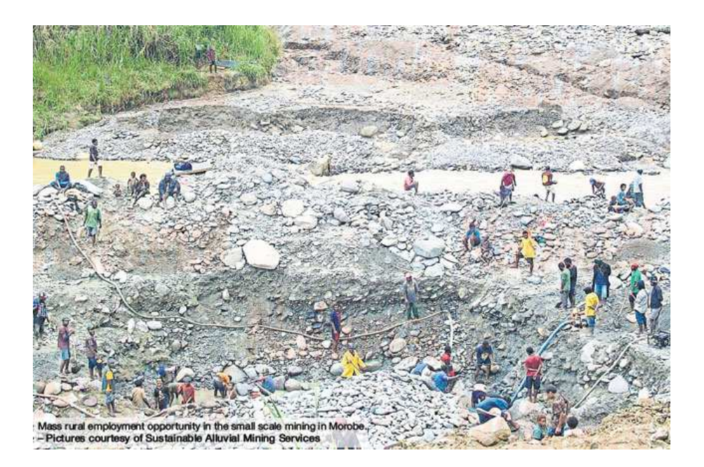
The alluvial mining industry has existed in Papua New Guinea for over a century since the day gold was first discovered on Sudest Island, Milne Bay in 1888. It is almost 132 years of the existence of