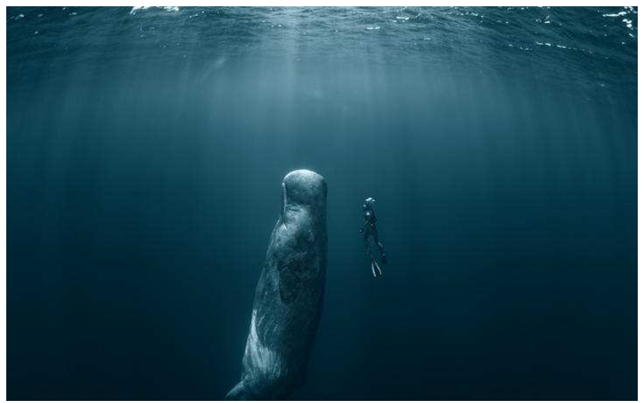
The Deep Sea Mining Campaign warns that if nodule mining is allowed to take place in the Pacific Ocean, species such as the Sperm Whale could be adversely affected.