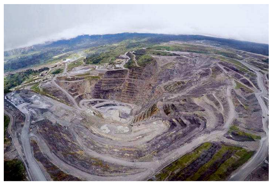
Aerial view of the Porgera gold mine.

minister believes this will mean significant training and skills transfer to local employees for decades to come. In addition he said "and there will be the creation of many local ancillary industries, including gold tourism facilities, and long-term supply requirements from local contractors and suppliers". Small-scale, local alluvial gold miners will benefit from the new refinery in PNG, while landowners can expect to receive better prices by avoiding the industry middlemen.