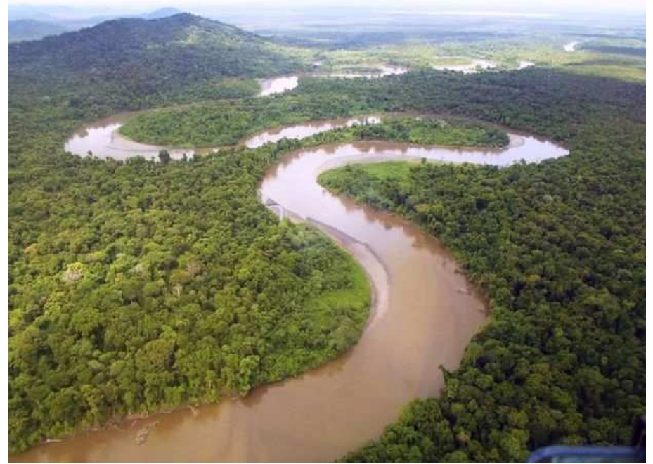
Frieda River heading north to join the Sepik River.

consent process, so that we believe in the process." he said. "The people along the river, 400 thousand or so people have been resisting, not just this mining company, but all mining companies that have tried to develop the place." The Sepik River meanders for more than 1100 kilometres through Sepik. The mine itself, which would be the biggest such development in PNG, is near the Frieda River, a tributary of the Sepik.