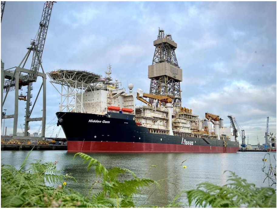
Hidden Gem (The Metals Company)

businesswire, November 04, 2021 08:00 AM Eastern Daylight Time