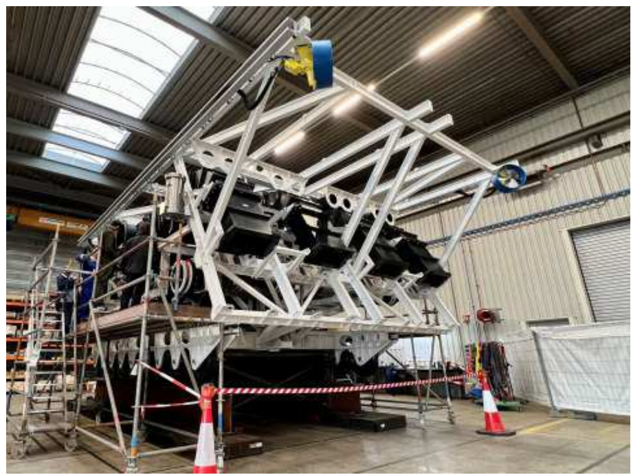
Prototype Nodule Collector Vehicle (The Metals Company)