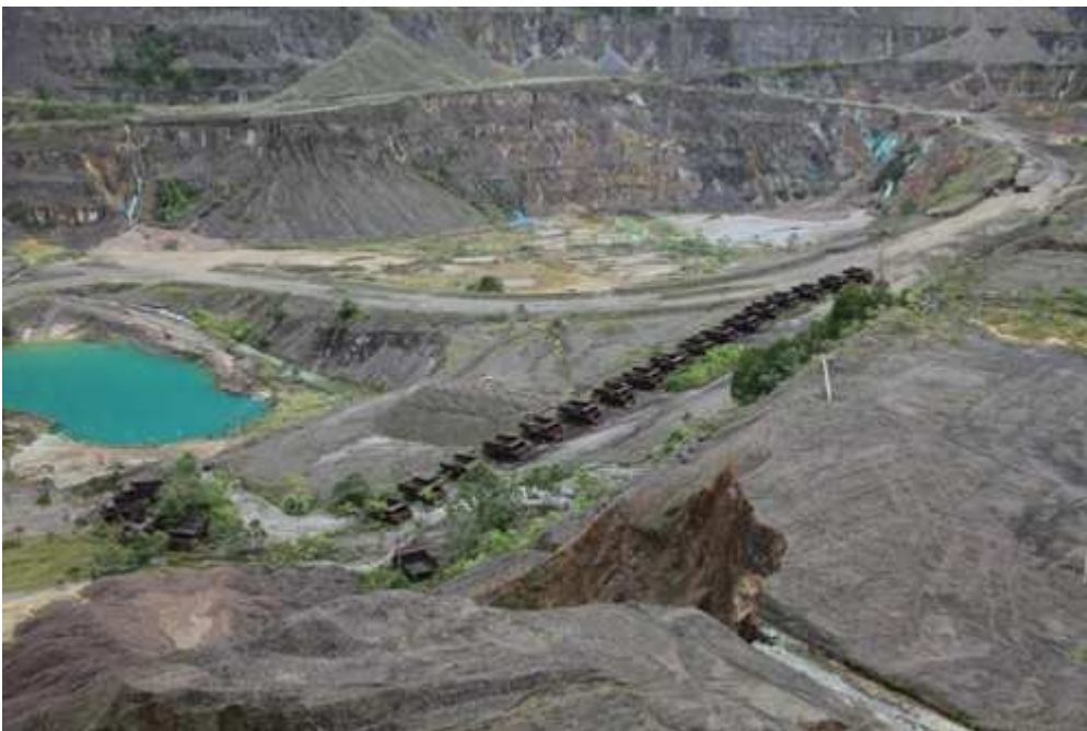
Abandoned Panguna mine