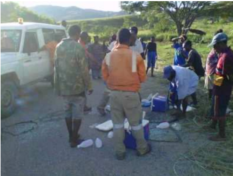
Water samples unlawfully collected by mine staff were emptied onto the road.

Riots have reportedly broken out against the Australian based mining company, Newcrest Mining, and Harmony Gold of South Africa in the Bulolo District of Morobe Province, Papua New Guinea. The violence has been sparked by the long outstanding grievances of the communities down stream of the Hidden Valley mine over mining pollution and sediments which affect the lives of thousands of people who say they do not benefit one way or another from the operations of some of the worlds biggest mining companies.