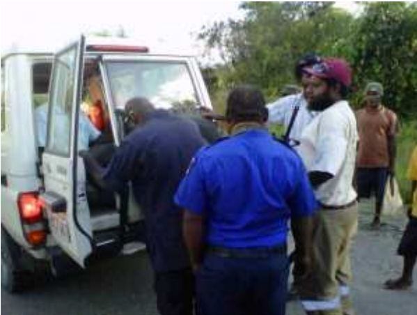
Police act as private security guards for the mine employees, even when the staff are acting unlawfully