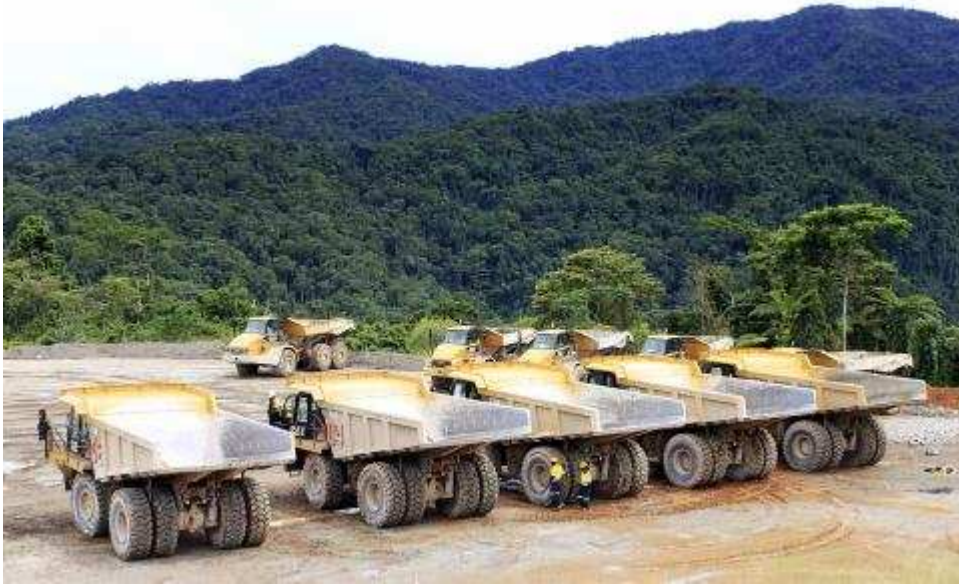
Two workers talk next to trucks before the reopening of the Gold Ridge mine in the Solomon Islands on March 4. May 01, 2011

Take the nearby Republic of Nauru, the South Pacific's poster child for a mining frenzy gone wrong. After decades of phosphate mining, Nauru had the world's highest GDP per capita, only to go broke once its reserves were mined out, leaving a legacy of widespread squalor and a mostly unemployable workforce. Nothing that drastic is likely to happen to the Solomon Islands, home to about 1,000 islands and 523,000 people. The Solomon Islands can still count on strong demand for palm oil and copra — the dried white flesh of the coconut used to make coconut oil — even as its exports of timber and fish wane. On his journey, David passed the reminders of that economy and a subsistence lifestyle that persists 33 years after independence from Britain. Women cook yellow fish and burnt-black potatoes smoldering in roadside umu pits; men weighed down with coconuts and pineapples trek to village markets. "Everybody here fishes or grows food. It's how we make our living," said David, who grows pineapples.